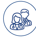
Senior nurses, paramedic staff, ambulance service and a wellness manager at premises