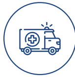
24/7 medical & ambulance facility