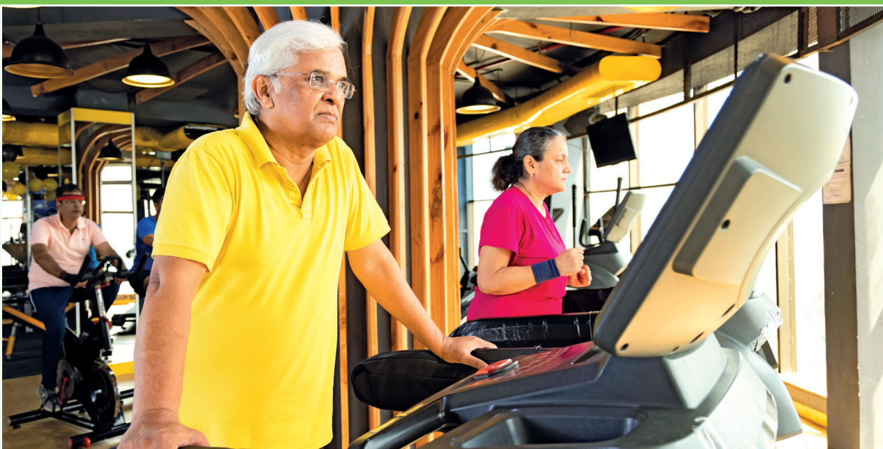
An exclusive clubhouse with a well-equipped gym and 24x7 wellness centre, reading room, multi-purpose lounge and a host of other engaging amenities.