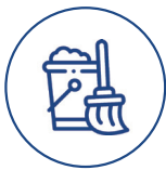
Essential housekeeping services assistance