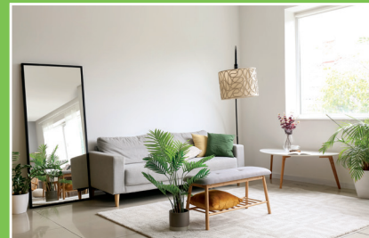
Two guest houses to accommodate guests and friends