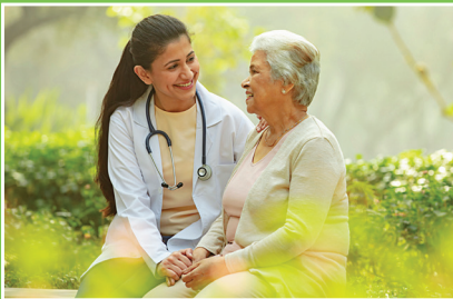
24x7 medical facility with an operational health care centre*

Optimized to the needs of seniors and aesthetically excellent, RIVA's design has been tailored to promote a comfortable, safe, and enriching environment.