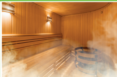
Spa and Sauna plus meditation areas