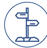
Signage for way-finding directions

*This facility is provided based on the residents common need and subject to all customers opting for the same