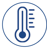
Temperature controlled indoor pool

RIVA is a thoughtfully designed community that prioritizes the well-being, comfort, and emotional fulfillment of its residents.