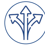
Scenic walkways through manicured gardens