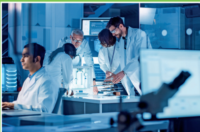
Pre-defined Medical Tests facility and onsite doctor check ups