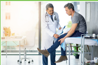
Qualified staff to take care of comfort, safety and security