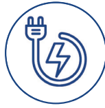
100% Power Back-up for Apartments and Common Area