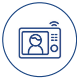
Intercom in Living room & master bedroom only*