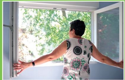
Well-ventilated air distribution