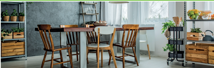
Centralized dining area with a running kitchen to provide healthy meals